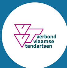
Belgium – VVT