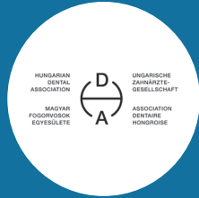
Hungary - Hungarian Dental Association